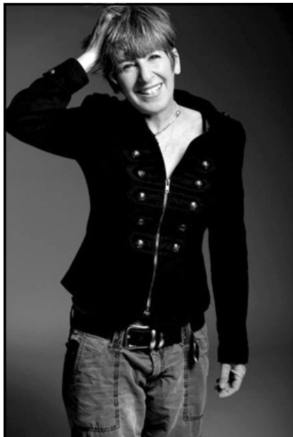
SONiA will perform at Sugarloaf Coffeehouse on October 17