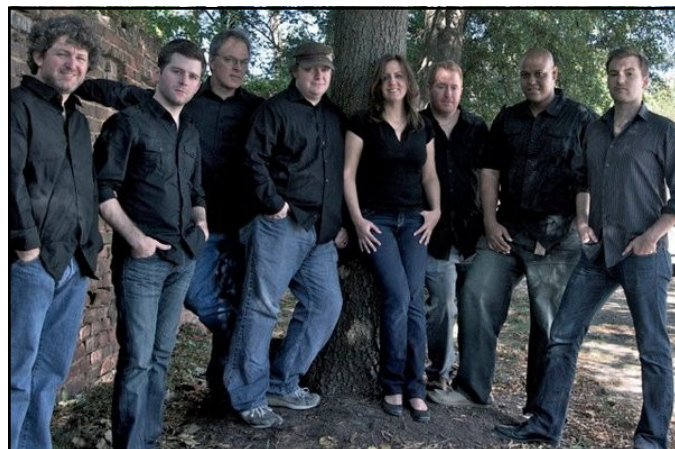
Old Bay Céilí Band

INFO: call 301-754-3611 and visit www.imtfolk.org