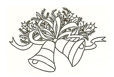
The Baltimore Folk Music Society would like to wish everyone a wonderful holiday season and a healthy and music-filled 2010!

Red Beans and Rice, Jambalaya, Cheap Beer. Great A/C! Admission $10. For info call 410-935-6002. For info about KoC or directions, call 410-744-3560.