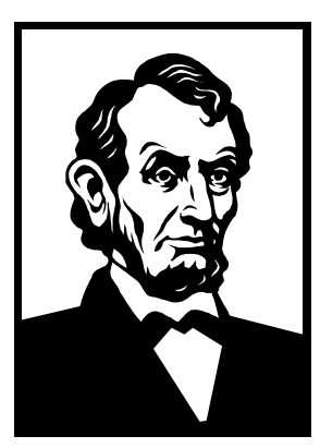
* BFMS Event