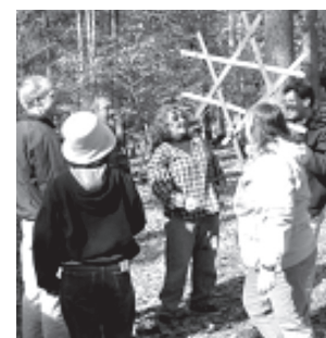
Learning Longsword Dance