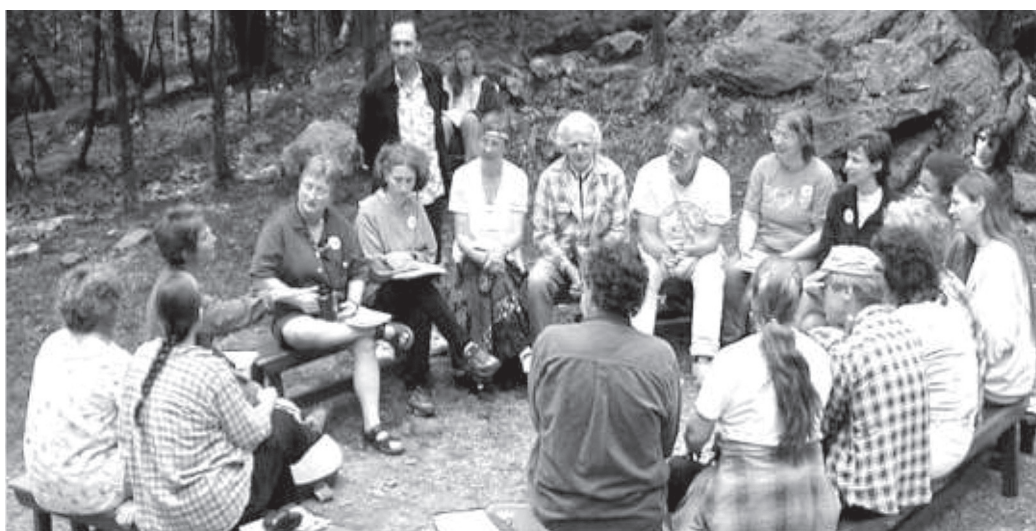
Sunday Morning Sing