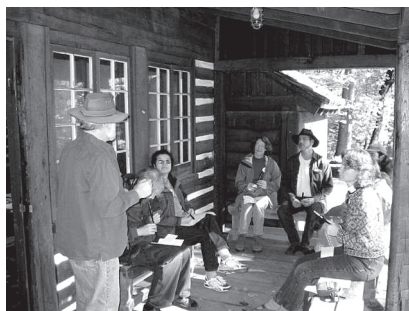
Tin Whistle Workshop