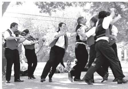
Charm City Rapper at the 2003 London (Ontario) Morris Ale

Charm City Rapper is looking for a few good men or women who want to learn rapper-sword dance, a traditional dance form that dates from 19 th century England. Charm City Rapper performs during the break of the September 8 dance at Lovely Lane. Interested? Contact Carl Friedman ☎ 410-321-8419 or ✉ carlfriedman@alumni.williams.edu